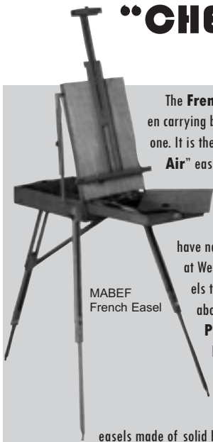
MABEF French Easel

The French easel is a wood-carrying box and easel all in one. It is the traditional " Plein Air " easel for field work.