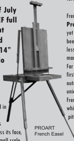
PROART French Easel

The Paragon full French easel is produced from elm wood in the Pacific Northwest. It has a unique design featuring a canvas holder that is uniformly flat across its face, allowing for better stability of small scale paintings. The canvas holder also extends to allow easy access into the storage box with-